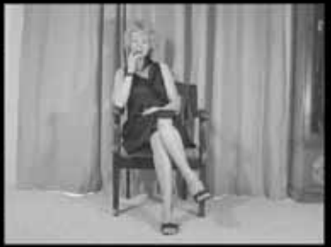
Four Scenes for Mother (2008)