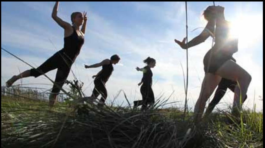
Raw Still from I Am Not An Animal