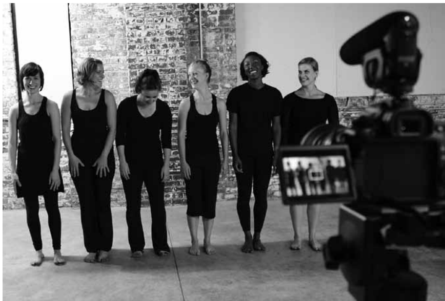
Rehearsal for I Am Not an Animal