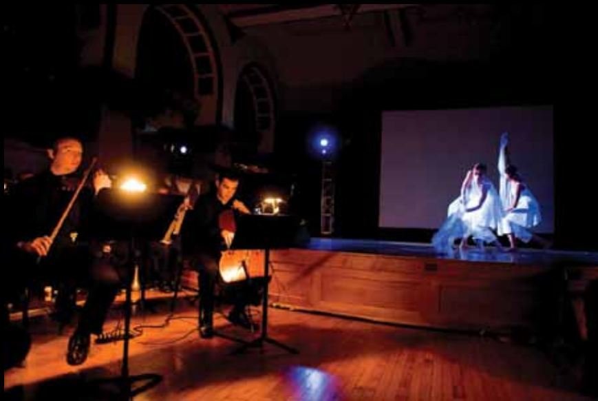
The Eternal Tao (2010) by Kyong Mee Choi, A multimedia opera. World Premiere performance at Ganz Hall