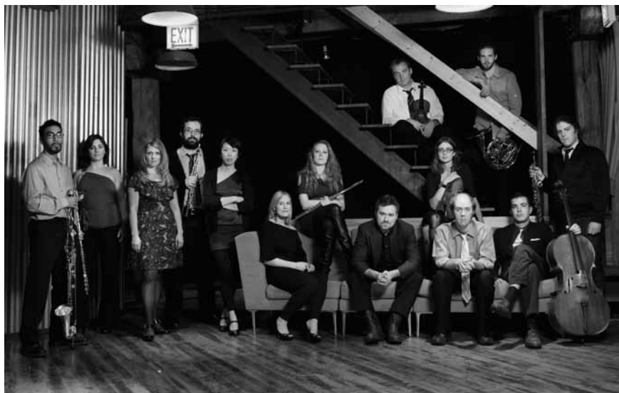
Ensemble Dal Niente, October 2010 at HCL