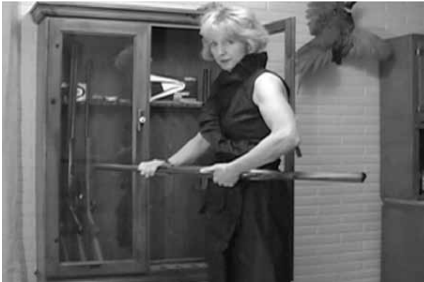
Making Pretend (2008)

In a pair of works from 2011, Smallwood's investigation of parental dynamics and media consumption turns to the discomfiting territory of parental sexuality. In Penthouse 7 , Smallwood mounted the re-photographed pages of her father's collection of Penthouse magazines. While the earlier work demonstrated the way in which the viewing of Hollywood cinema is predicated upon identification with characters, Penthouse 7 explores the psychic distancing necessary for the consumption of pornography. As Susie's reenactments replicate the process of character-identification, the father's disembodied gaze is redoubled by its presentation through the objects of its lust. In Four Scenes for Mother , Susie narrates sex scenes from four popular films from the 1990s— Ghost , Pretty Woman , Basic Instinct and Sliver . This narration is presented in split screen with the reenactment of these scenes based upon Susie's descriptions. By insisting on the female perspective detailed by a female narrator, Smallwood challenges the notion of a structurally male cinematic gaze posited by Laura Mulvey in her landmark essay "Visual Pleasure and Narrative Cinema."