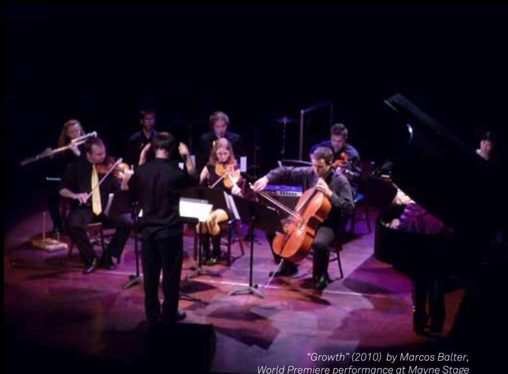
"Growth" (2010) by Marcos Balter, World Premiere performance at Mayne Stage