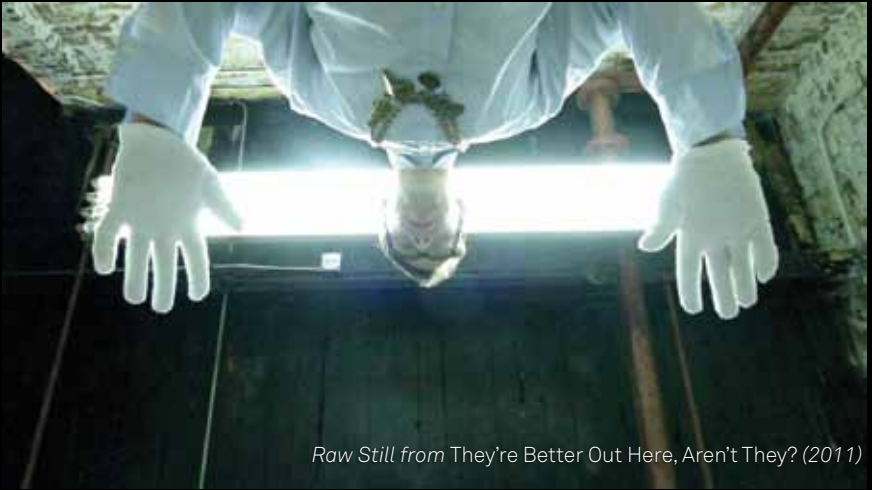
Raw Still from They're Better Out Here, Aren't They? (2011)