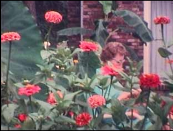
Super 8 stills for trace