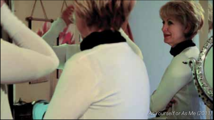
As Yourself or As Me (2011)